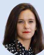
Tory Steel Director